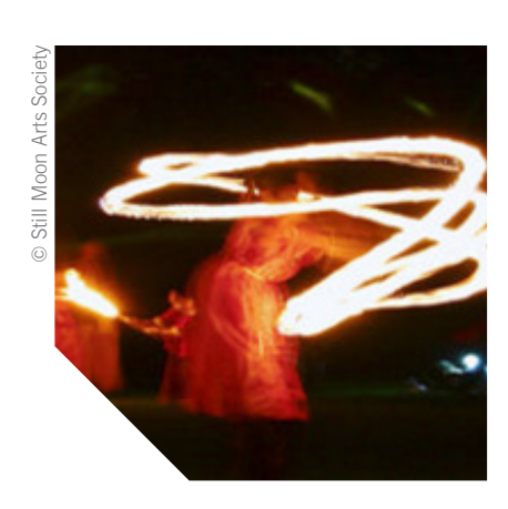
VANCOUVER, BC, CANADA – STILL CREEK MOON FESTIVAL

This arts-science-education collaboration aims to foster awareness and understanding of water issues in Auckland.