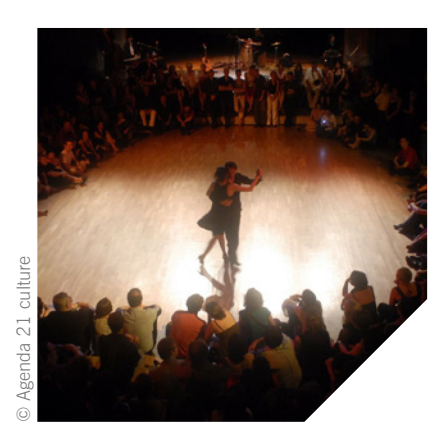
LILLE, FRANCE – BAL À FIVES

Artistic activities can initiate public dialogue, encourage connections to the local environment, catalyze collective action, and invent more sustainable living practices.