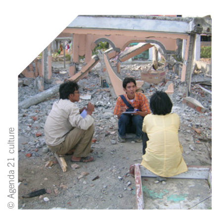
BANDA ACEH, INDONESIA POST-TSUMANI CULTURAL HERITAGE PROJECT

In Buenos Aires, music, heritage, education, and neighbourhood revitalization go together.