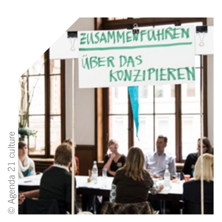
HANNOVER, LOWER SAXONY, GERMANY – TWINNING FOR A CULTURE OF SUSTAINABILITY

The project has strongly related the environmental and the cultural dimensions of sustainability.