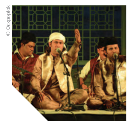
DELHI, INDIA – HUMA-YUN'S TOMB, SUNDAR NURSERY, AND HAZRAT NIZAMMUDIN BASTI

The whole community is involved in planning and implementing this cultural heritage project.